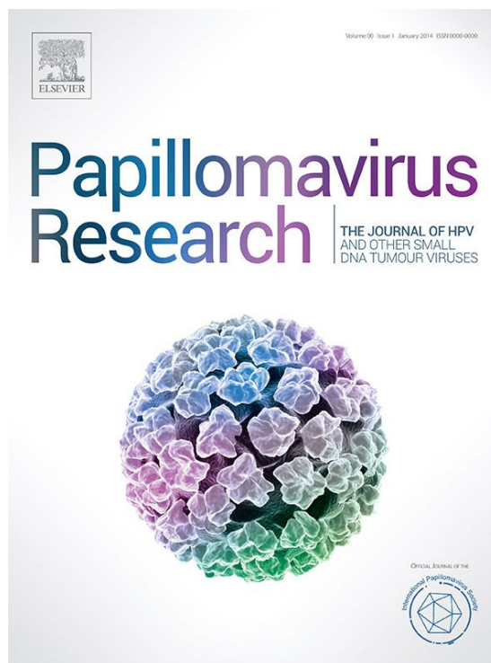
Papillomavirus Research Journal

News from the HPV Prevention and Control Board