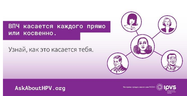
HPV Campaign - Infographic in Russian

Online performance indicators for Campaign 2021 are very strong across the board. We reached a lot more people and in languages other than English. Our on-line communities grew; social media traffic increased significantly. Campaign 2021 outperformed not only previous years' performance but also exceeded a number of average statistics for similar posts on social media channels. Here are a few preliminary statistics: