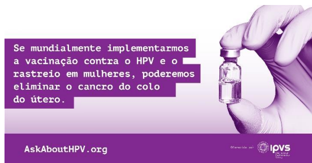
HPV Campaign - Infographic in Italian

commonly spoken languages to campaign materials (taking us up to 10 languages in total). These efforts helped bring in 20 new operating partners taking us up to 100+ partners world-wide.