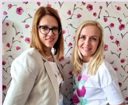
Image: Representatives of The Mallow Flower Foundation, Hungary

Within the HPV network there are many inspiring and informative stories to be shared, which is why IPVS is launching 'HPV Stories', a new feature on the AskAboutHPV.org website. The goal is to reduce the stigma around HPV and to convey the message that HPV affects everyone, directly or indirectly.